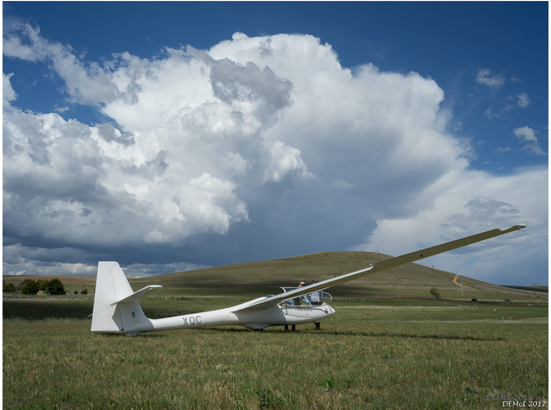
SZD-50 Puchacz ('Owl')